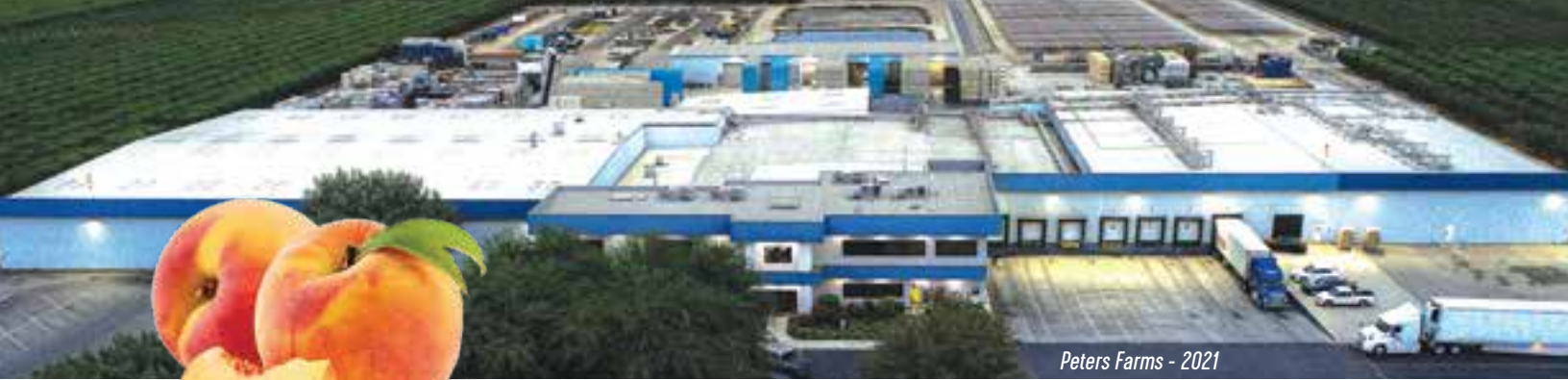
Peters Farms - 2021

on the farm was like and helped us understand the nature of their farming business.