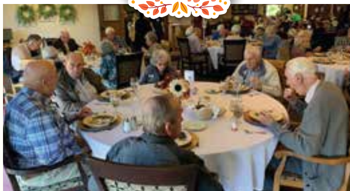
Thanksgiving Luncheon - Our staff shows their gratefulness by serving our residents a Thanksgiving meal.