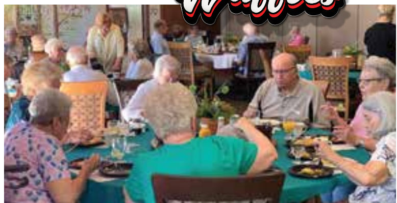
Independent Living love the chance to share breakfast together with the Omelet and Waffles Breakfast