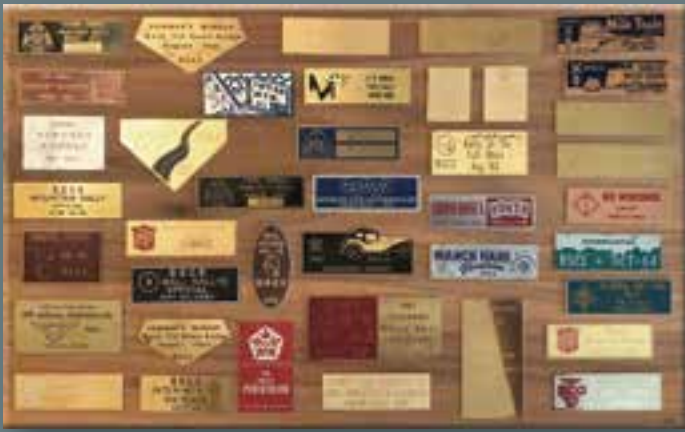
Collection of Rally plaques from memorable races.