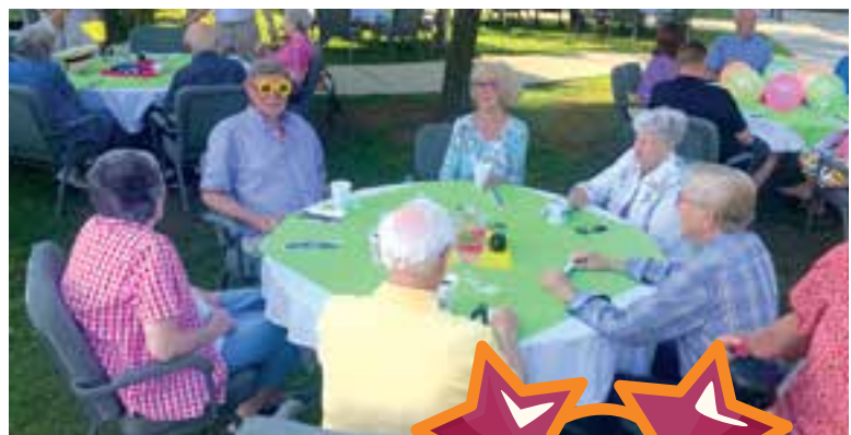
Pancake Breakfast 2023 with fun sunglasses and smiles!