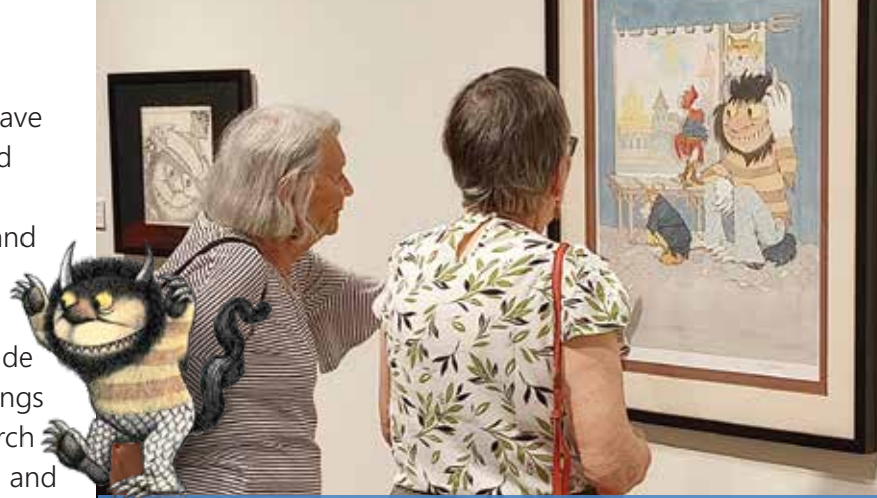
Artist Maurice Sendak Museum Trip