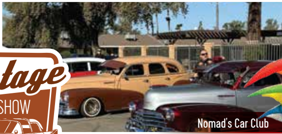
Nomad's Car Club