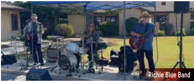
Richie Blue Band