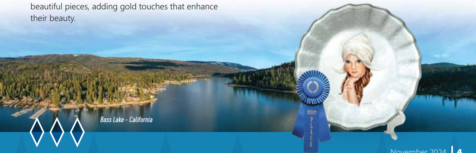
Bass Lake - California